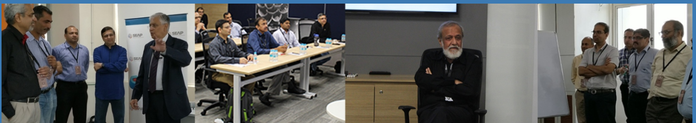
Glimpses of SEAP Gurukul's 1.0